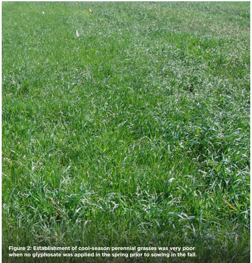
Figure 2: Establishment of cool-season perennial grasses was very poor when no glyphosate was applied in the spring prior to sowing in the fall.

Establishment of cool-season perennial grasses was very poor in Experiment I (no